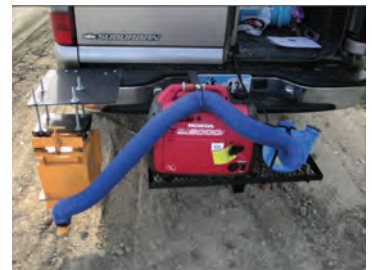
Dustometer setup (l. to r.), dustometer, generator and vacuum.

Three different construction methods were used: RAP was placed with haul trucks and shaped and blended with a motor grader; RAP was placed with haul trucks and blended with a reclaimer and shaped with a motor grader; and RAP was blended with virgin aggregate at the stockpile, then the blend was hauled to the roadway, shaped with a motor grader, and compacted with a single steel drum roller. The most critical element of placing, blending and shaping the RAP blends was the method's ability to provide complete blending, thereby avoiding segregation that led to several distresses including loose aggregate, dust and rutting.