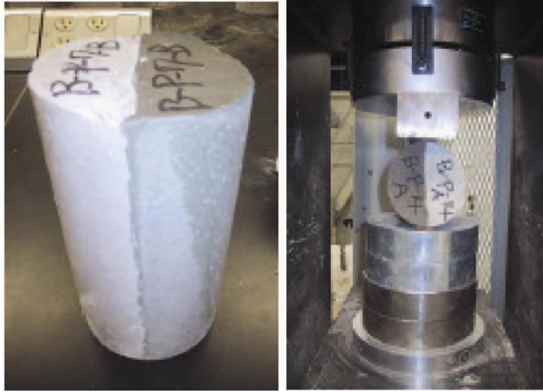
Fig. 2 Indirect tensile strength test [8].